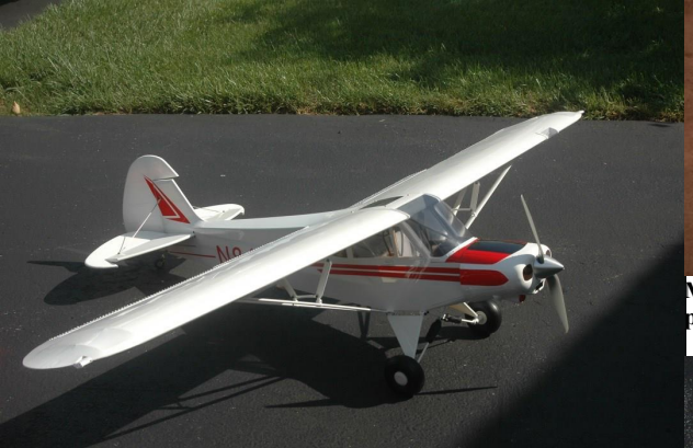
Electifly Super Cub. 68" electric. Flown only for MAN review. 5 channel, inc. flaps. Uses 4S 3200 mAH LiPos