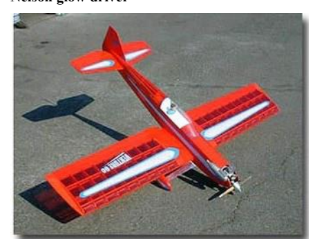
BTE Venture 60 (mfg photo). A sweetheart of a plane. Glow, Enya 74? Mine is covered similarly. 72ö ws Airtronics black electronics