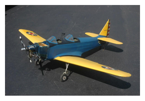
P-19, 80" WS. Powered by OS/120. Color matching cowl Nelson glow driver