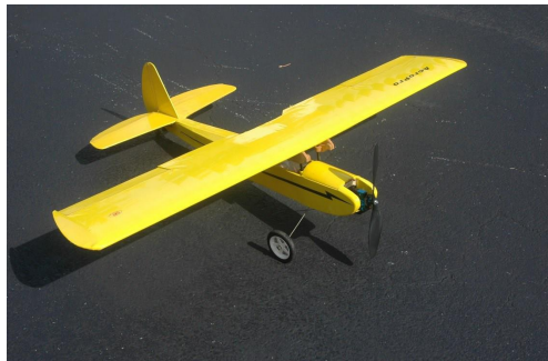
SR Batteries Cutie. 46 " ED, geared brushless, 4 channel. A fun plane to fly. I may keep it.