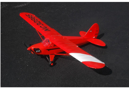
Hobby Lobby J-5. 43" ws, EPO foam construction. Minor LG damage. Flies on 2S1600 LiPo; 2 included