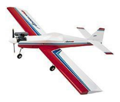
Hangar 9 Advance 40, 60" ws, Trike gear sport plane Enya 54. Mfg photo but mine is almost identical Airtronics black electronics