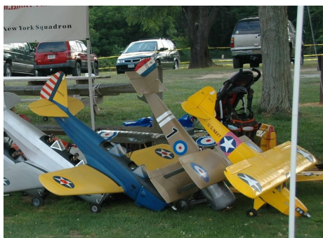
The biplane is a Sopwith, pperhap Strutter. Gas powered, 60 wing span Note also the PT-19 with cowl