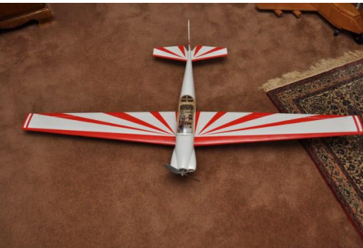
Model of Fournier RD-4, I think. Motor glider, 4 channel, perhaps 50" ws. Out runner. Needs 3S1600 LiPo