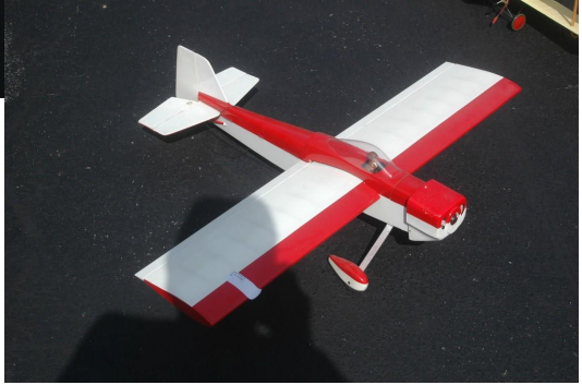
Lanier Stinger 10, 4 channel, 36" wing span. Out runner motor available with it.