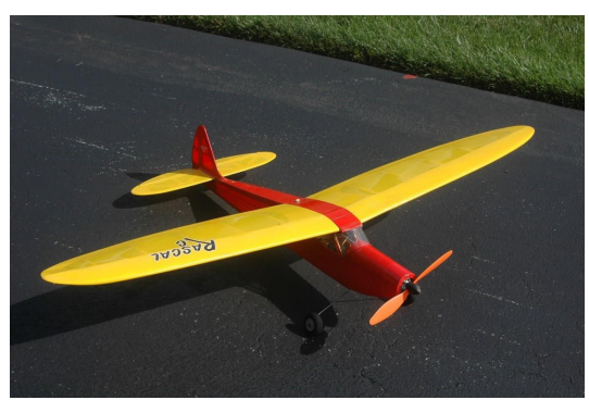
A Sig Racal C, 47" ws, three channel, out runner motor. Removable wing. Fun little toss around the sky plane. Needs 2S1200